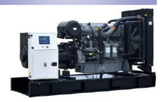
Open Type Image for illustration purposes only