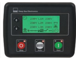
DSE4520 MKII AUTO START & AUTO MAINS FAILURE CONTROL