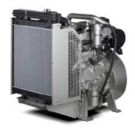
PERKINS Engine 1106A-70TAG3