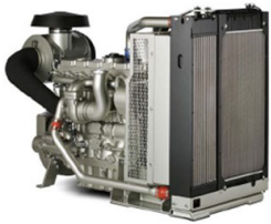
PERKINS Engine 1106A-70TAG4