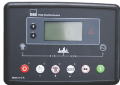
DSE6120 MKII AUTO START & AUTO MAINS FAILURE CONTROL