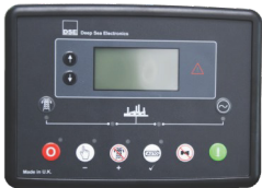
DSE6120 MKII AUTO START & AUTO MAINS FAILURE CONTROL