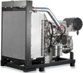
PERKINS Engine 2206A-E13TAG2