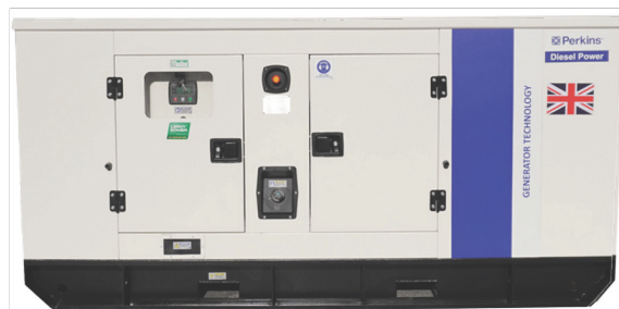
Silent / Closed Type Image for illustration purposes only.