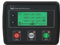
DSE4520 MKII AUTO START & AUTO MAINS FAILURE CONTROL