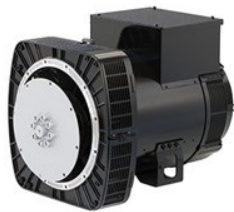
Leroy Somer TAL-042-H