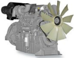
PERKINS Engine 2806A-E18TAG1A