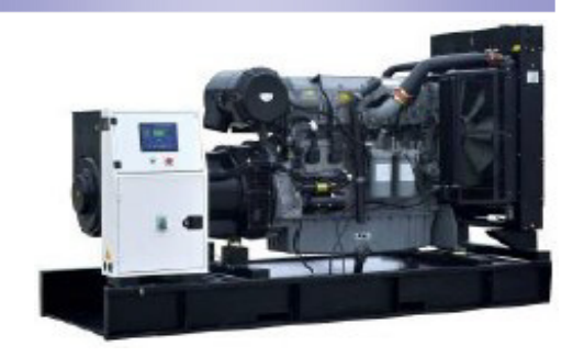
Open Type Image for illustration purposes only.