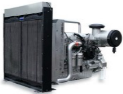
PERKINS Engine 4006-23TAG2A