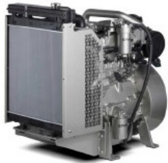
PERKINS Engine 1104A-44TG2