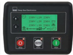
DSE4520 MKII AUTO START & AUTO MAINS FAILURE CONTROL