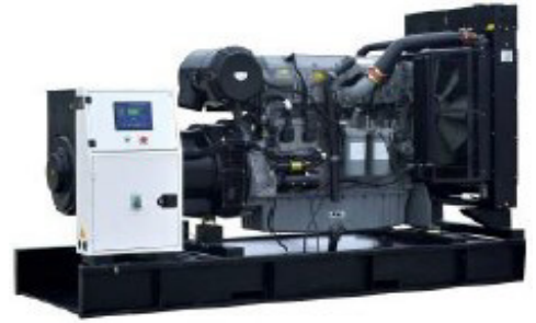
Open Type Image for illustration purposes only.

WE MAKE YOUR POWER SOLUTIONS SUSTAINABLE