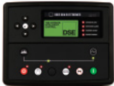
DSE7320 MKII AUTO START & AUTO MAINS